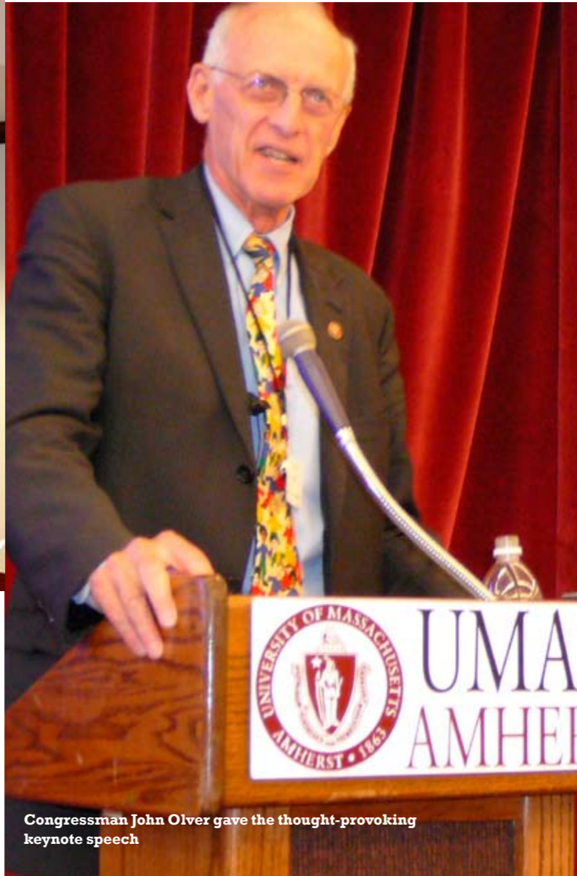
Congressman John Olver gave the thought-provoking keynote speech

However, despite the recent release of two key federal reports pointing to a "looming disaster" for highway