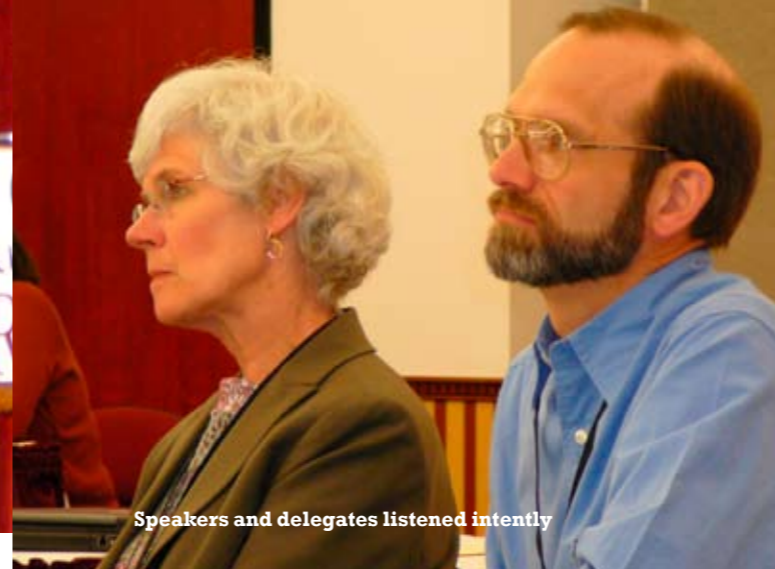
Speakers and delegates listened intently