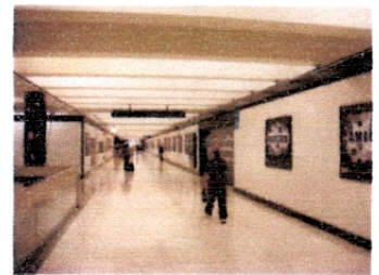
Long distances, by walking or moving walkways, to Powell Street Station/ Metro/ BART.

Currently, along the Stockton/ Columbus Corridor, the 30-Stockton, 45-Union and 8X buses all go directly to Market Street/ Buses/ Metro/ BART. But the proposed Central Subway goes to a Union Square Station---1,000 feet from the Powell Street Station/ Metro/ BART. Using a stop watch , the actual total travel time by bus is faster than that by subway.