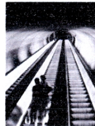
Long escalators up seven-stories at Union Square Station.