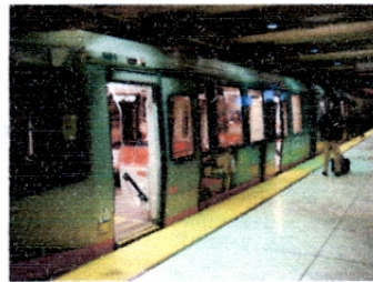
Waiting for the short 3-car maximum length trains (Hong Kong has 8-car trains).