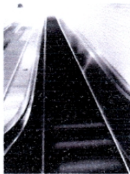
Deep six-story escalators to subway platforms.