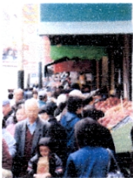
Walking to the Washington Street Subway Station.