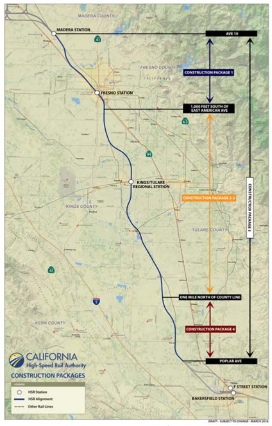
Figure 1: CP1-4 Map<sup>2</sup>

The Central Valley segment is predominantly a "greenfield" project with the civil work currently under construction. The Central Valley segment will serve as a foundation for future high-speed rail operations once it is connected to the planned Valley to Valley Line. Prior to connecting to the Valley to Valley Line, the Authority will not operate stand-alone service on the Central Valley segment, but plans to eventually use it as a test track prior to high-speed train operations or for use by the San Joaquins.